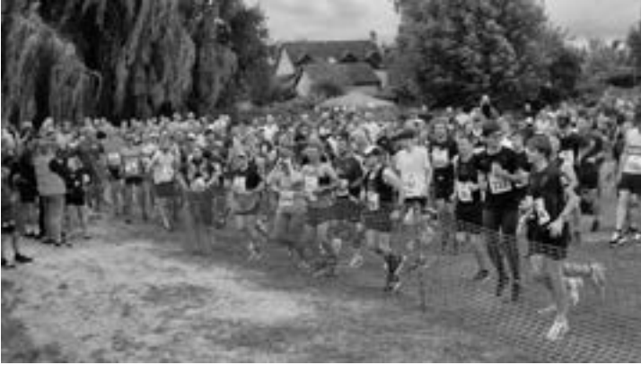
Warming up before the race

After an incredibly hot and dry spell through the spring months, the Fen Gallop committee heaved a huge sigh of relief at not having to deal with a flooded Recreation Ground, as was the case in 2024. However, the wish for rain was granted, as the heavens finally decided to open on race day. Typical! The weather certainly keeps the planning committee on its toes each year! With the intense heatwaves of June behind us, over 300 runners were treated to much cooler running conditions across our two running events: the chip-timed 10k and 4-mile races.