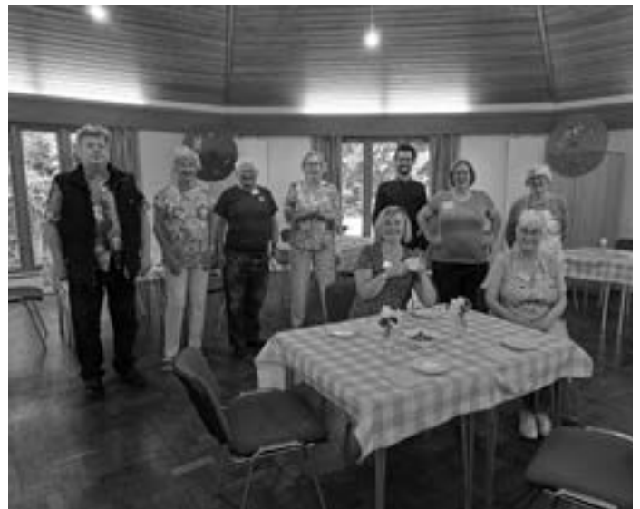
Helpers at the Memory Box Café