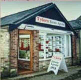
Tylers Willingham ~ 2023