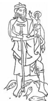
Sketch of the St Christopher Wallpainting in the Church

The occasion of a new Rector gave the opportunity for him to limewash over existing paintings and commission new ones more to his taste. Willingham Church has no less than five layers of paintings which have been conserved. One of the best, from the second layer, is that of St Christopher, the patron saint of travellers, painted around 1380 on the nave wall almost opposite the main door. He is standing in shallow water, the Christ child on his shoulder. He has a 'fish fork' staff and several fish around his feet. They have been identified as burbot, perch, roach and eel, all fish that were then commonly found in the surrounding fens. It is one of the finest examples of a wallpainting of St Christopher in England.