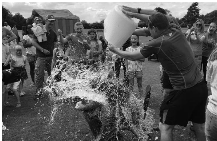
Soaking the Head Teacher