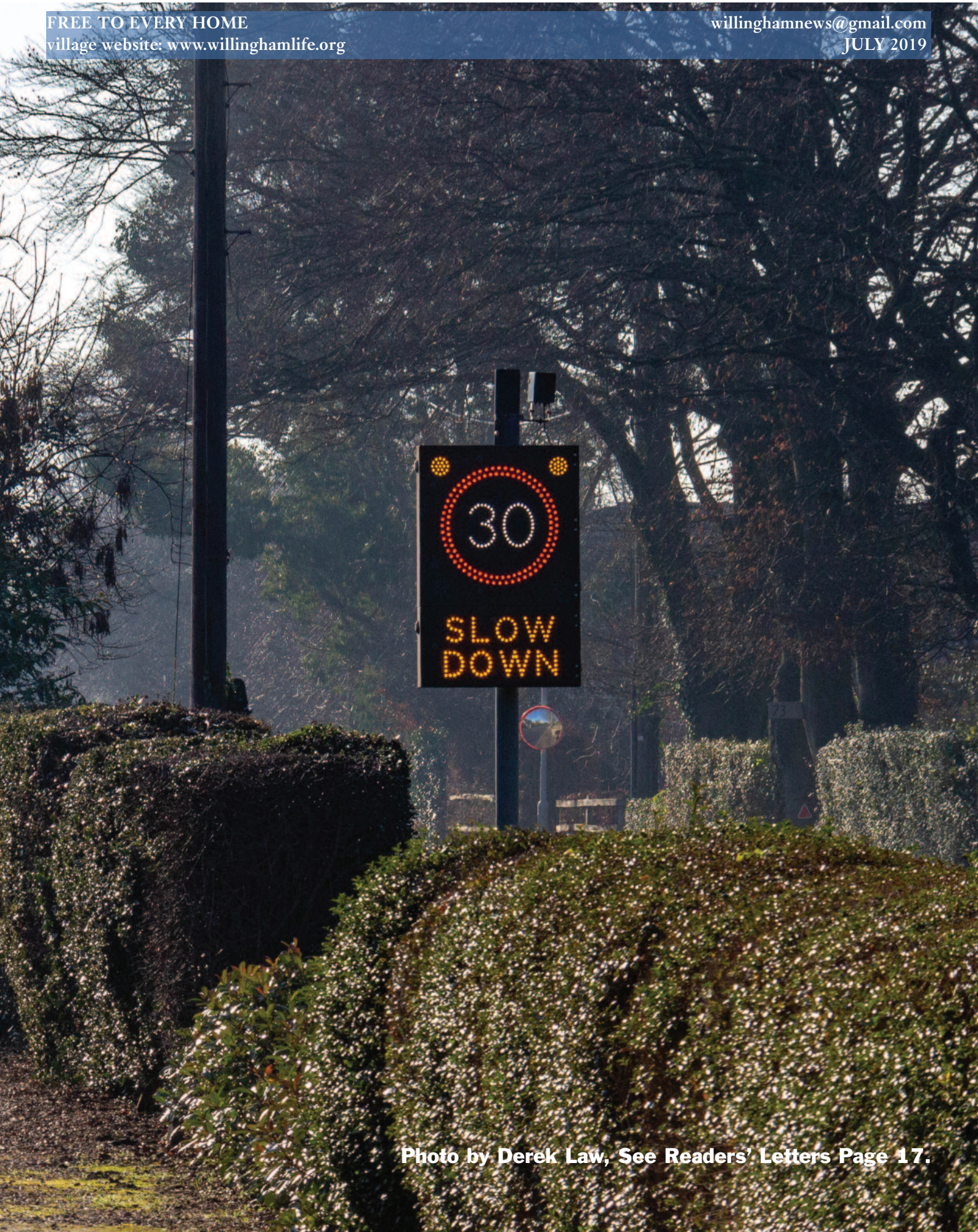
See Readers' Letters Page 17.