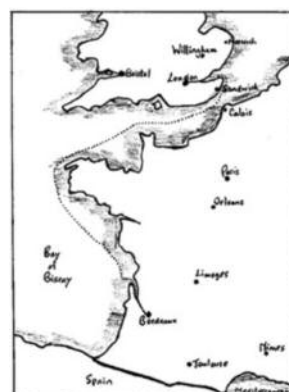
Map of England and France with routes to Bristol and Bordeaux

Richard's travels prompt the question of how he would have travelled. The national road system was still based largely on Roman roads built 1,000 years earlier and routes were determined by available river crossings. The route from Cambridge to Bristol via London should have been relatively straightforward on old Roman roads, but even this is likely to have taken a week's travel by horse, with security a constant problem. The route from Willingham to Bordeaux was on a different scale. He is likely to have sailed from London or Sandwich down the full length of the English Channel and across the Bay of Biscay. Against prevailing winds, this could have taken several uncomfortable weeks. It would not have been without risk either, but probably safer than the 400 miles overland on horseback across France,