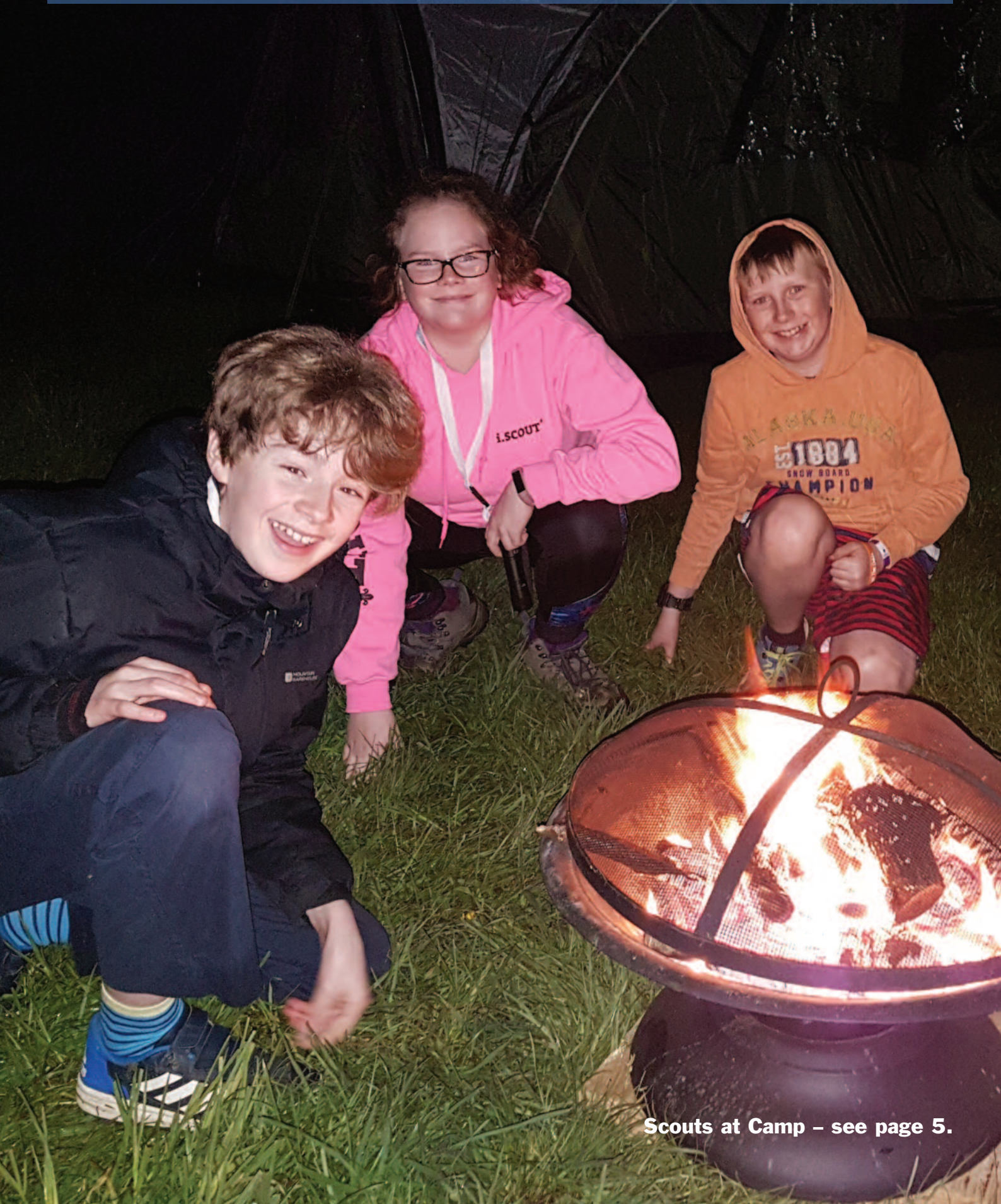
Scouts at Camp – see page 5.