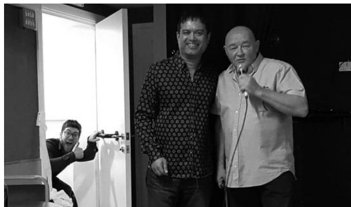
Paul Sinha opens Accessible Toilet.

We were honoured that Paul Sinha, our headline comedian and TV quizzer of The Chase , opened the new accessible toilets at the most recent Custard Comedy Night in April. We would like to say 'by a ribbon' but in true comedy style, loo roll was used! The next Comedy Night is Friday 11 October . Tickets are on sale now from www.wegotickets.com/event/471597