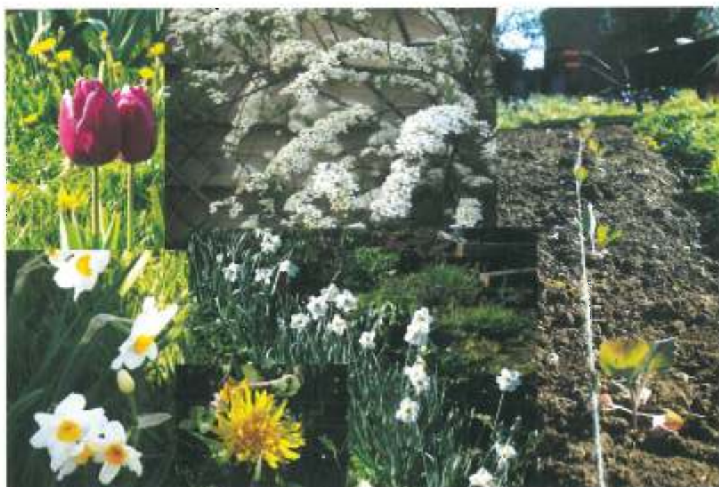
Spring on the allotment.