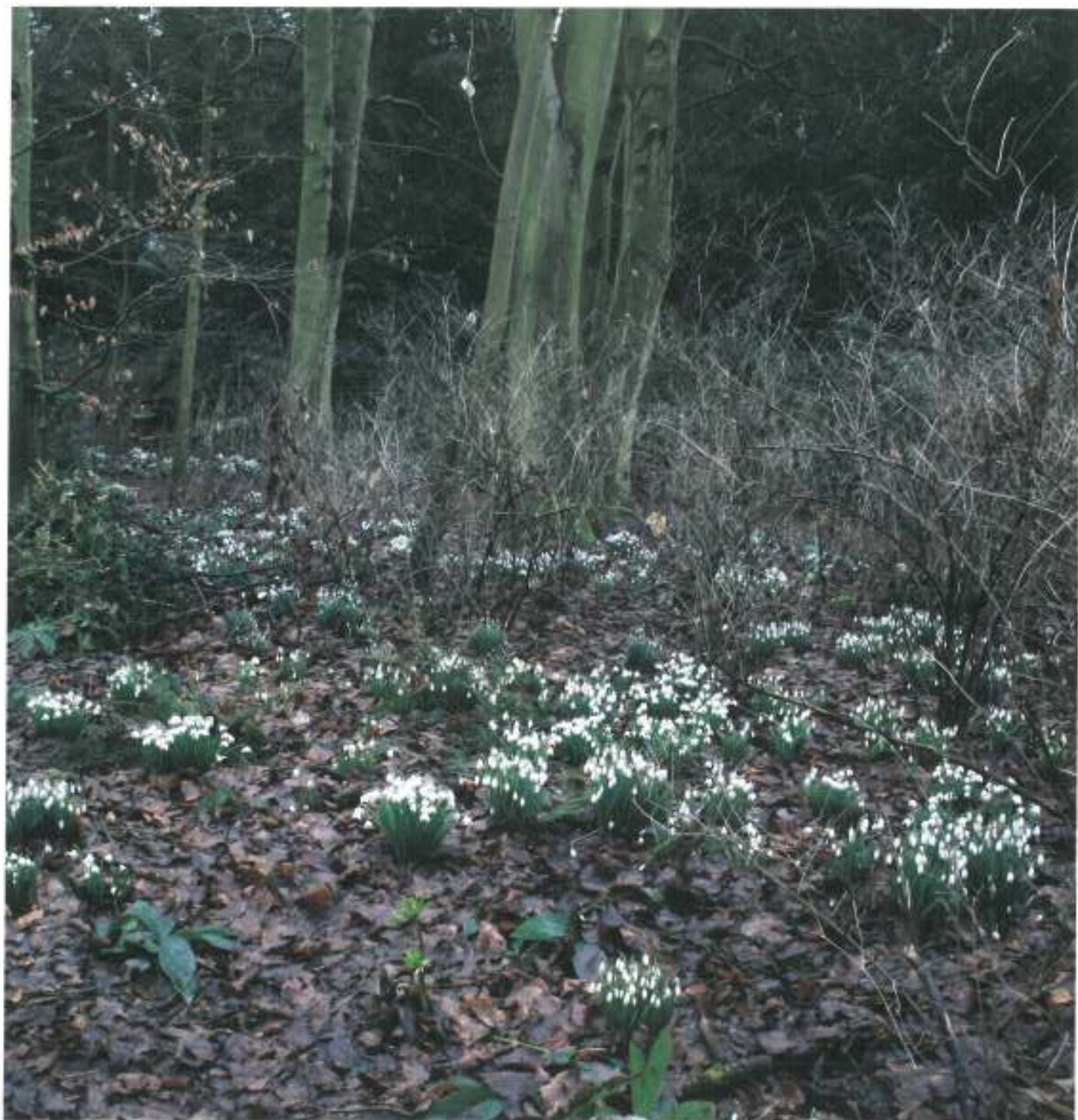
Snowdrops at Anglesey Abbey, Reg Purnell