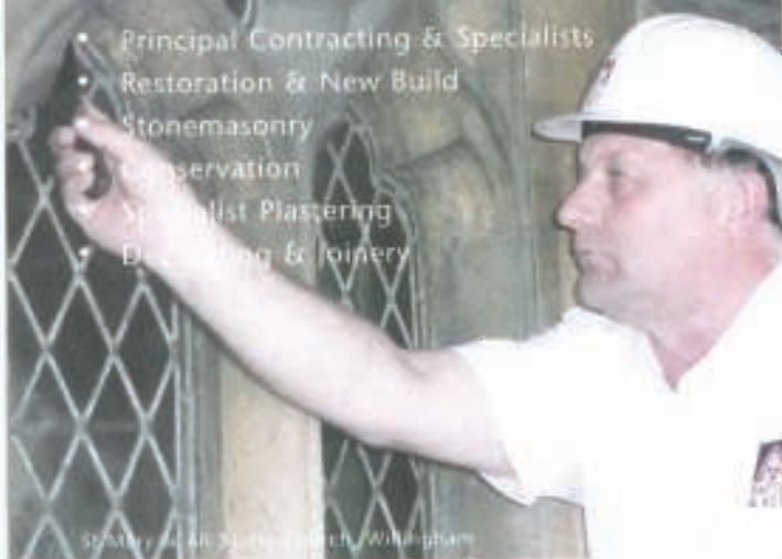
St Mary & All Saints Church, Willingham