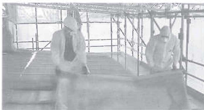
Workmen removing the old lead.

Local fund-raising has, of course, been very important. Two examples: The monthly cake stall, on the first Saturday of the month, and Rene Gould's bric-à-brac stall.